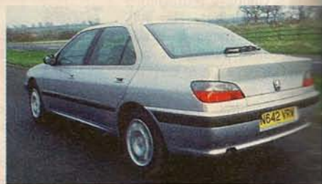
The coupé is built on the 406 saloon's chassa Auto Express · March 22, 1996 - 1