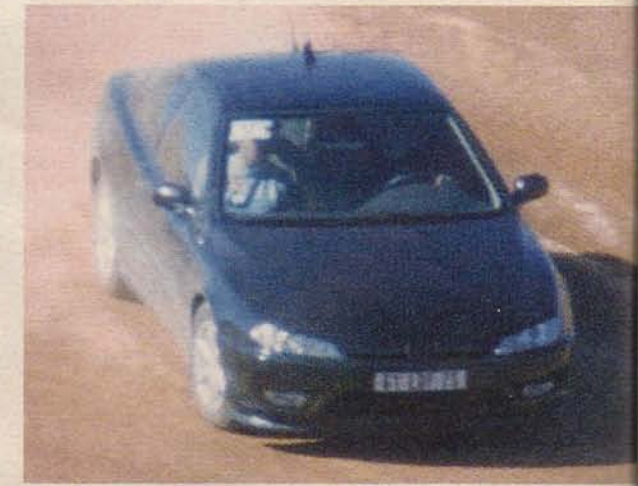
Coupé shares the saloon's sweeping nose and slim headlights

With no performance saloon in the new range (the Mi16 model