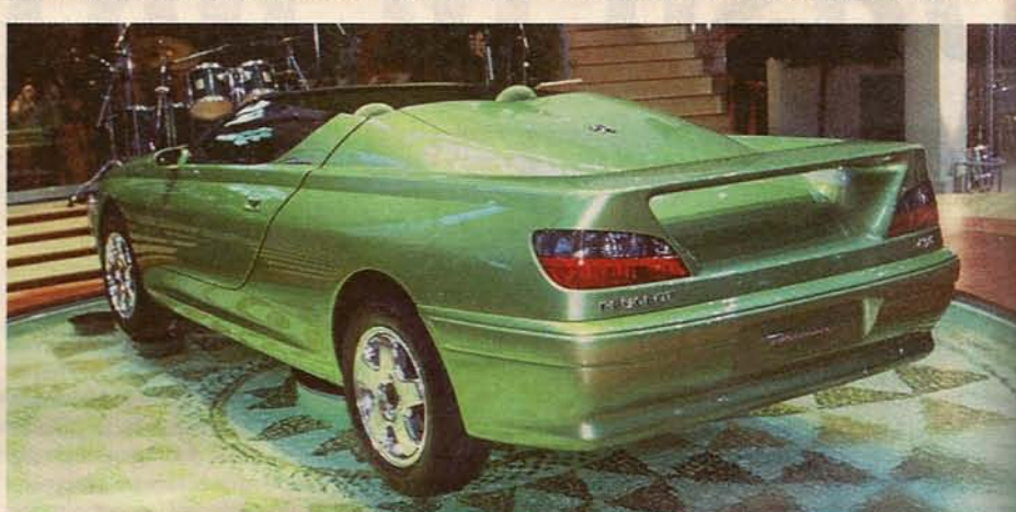
Peugeot's heavily stylised and exaggerated Toscana concept car had no influence on the coup