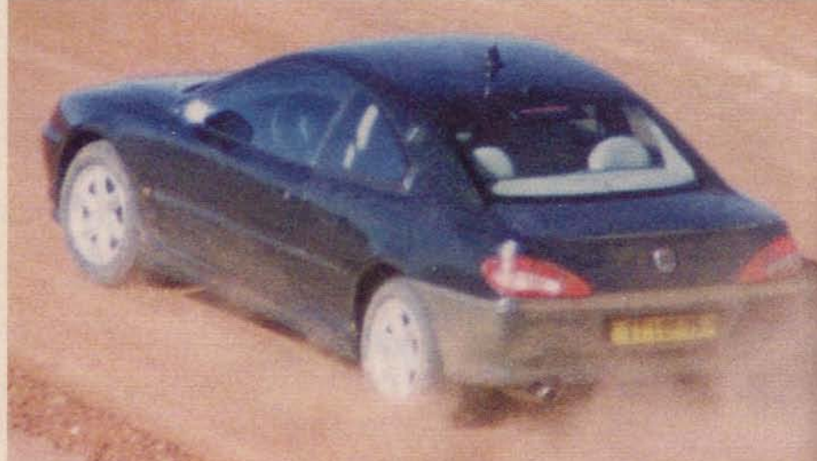
The difference between the coupé and its four-door cousin is most striking from the rear end