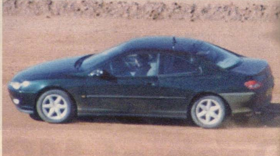
Flowing lines and curvaceous roofline give the coupé a sportier and more aggressive stance